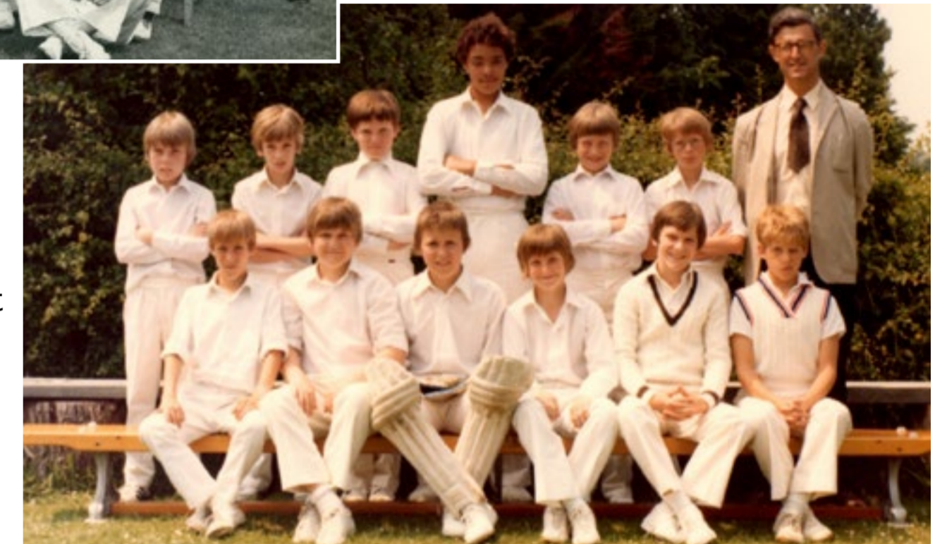
1982 Under 12s cricket