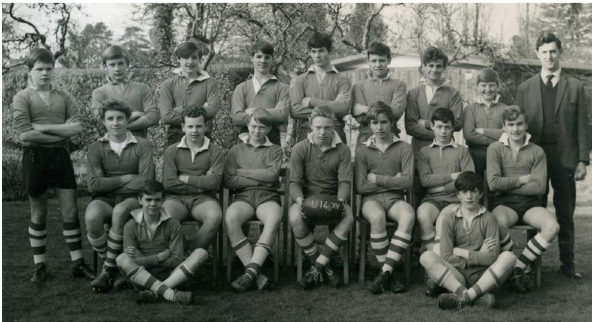
1967 Under 14s XV rugby