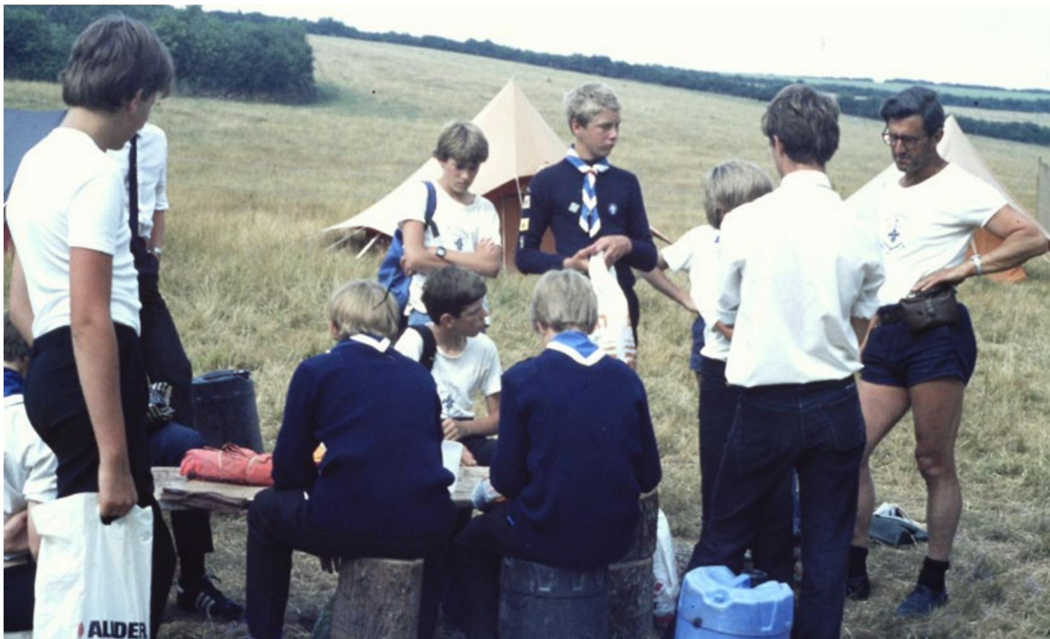
1984 Dart. Getting ready for a day out