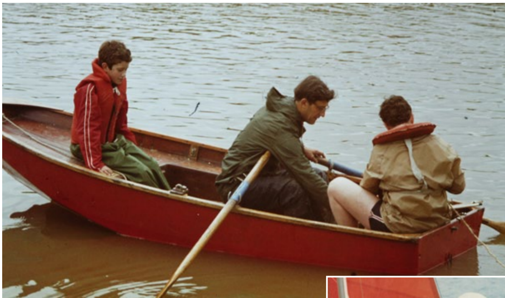
1983 River Arun

“Robin was a very important influence when I was growing up, in particular I benefited hugely from my time in the Scout troop.”