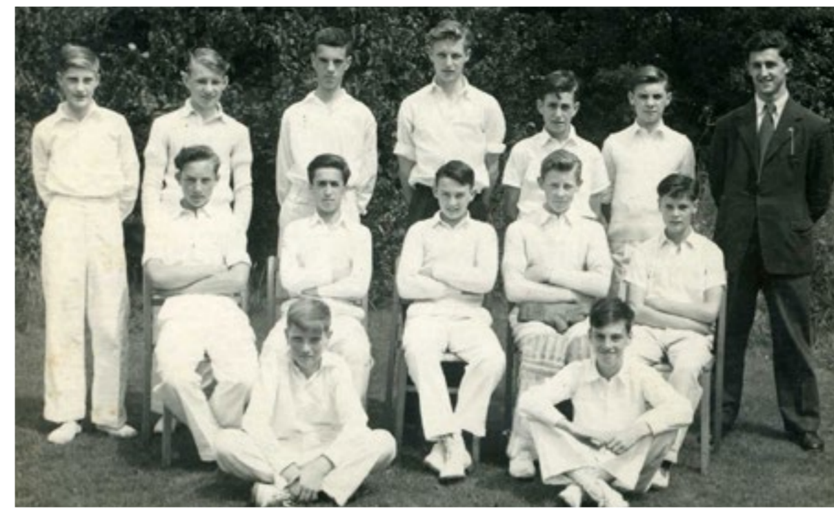
1957 Under 14s cricket