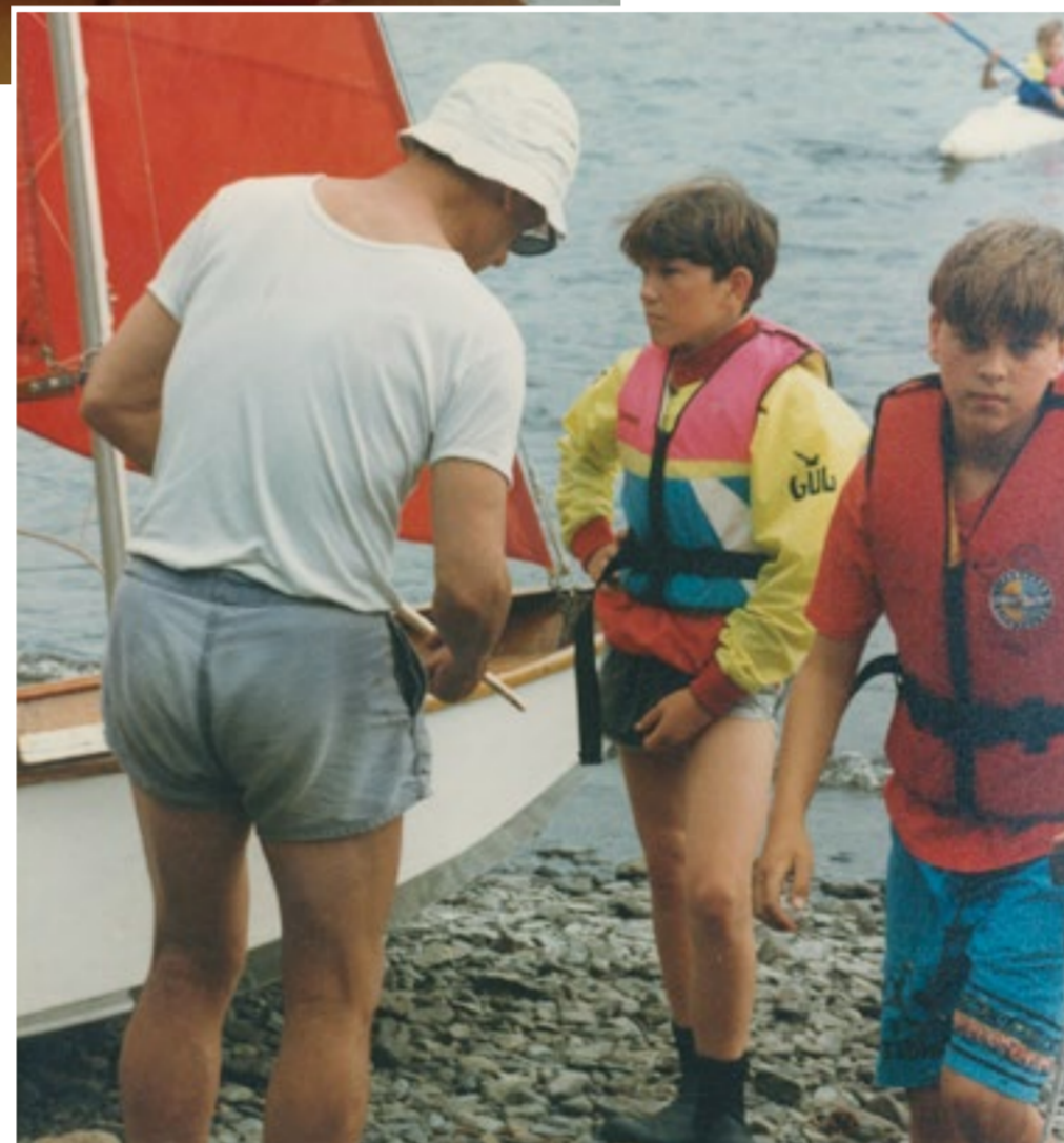
1995 Lake Windemere