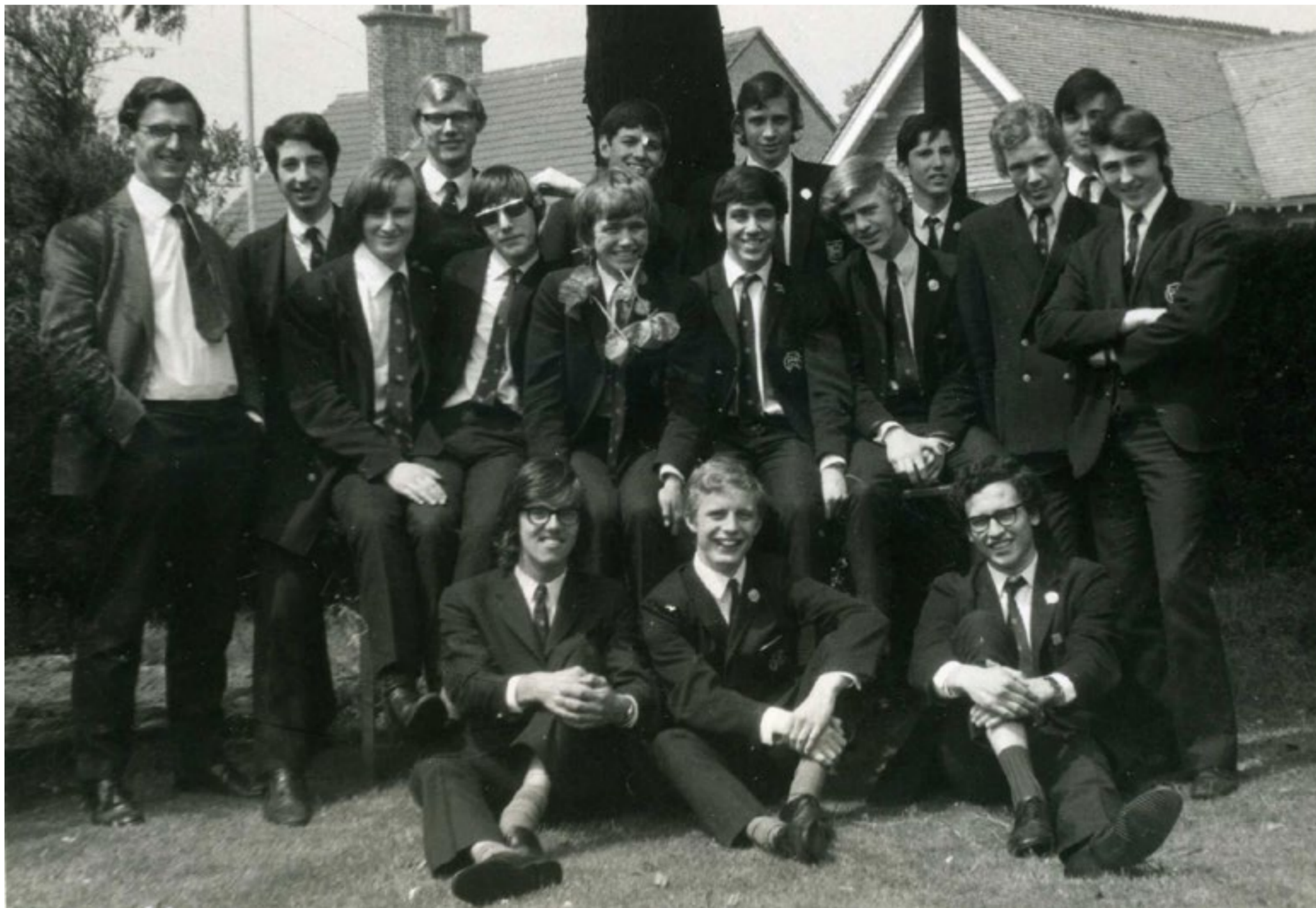
1972 Upper Sixth